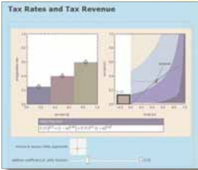
Model the effects of changing tax rates on tax revenue.