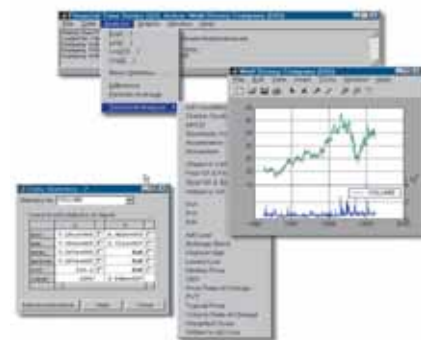
The Financial Toolbox provides a GUI so you can directly load, display, and analyse time series data.